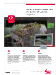
Leica Cyclone REGISTER 360