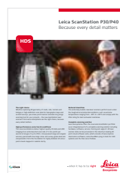
Leica ScanStation P40/ P30

Leica Geosystems AG Heinrich-Wild-Strasse 9435 Heerbrugg, Switzerland+41 71 727 31 31