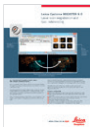
Leica Cyclone REGISTER