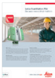
Leica ScanStation P16

Illustrations, descriptions and technical specifications are not binding. All rights reserved. Printed in Switzerland – Copyright Leica Geosystems AG, Heerbrugg, Switzerland 2015. 832266en – 03.15 – INT